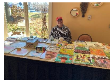
Be sure to visit "The Book Guy"