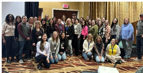
Mohawk Valley 2024

5:00 pm – 6:00 pm Meet and Greet Informal Gathering